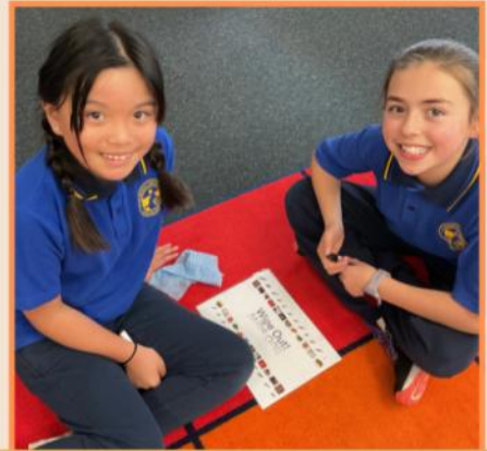
Year 3, 4, 5: revising foods in Chinese and putting them into statements and questions.