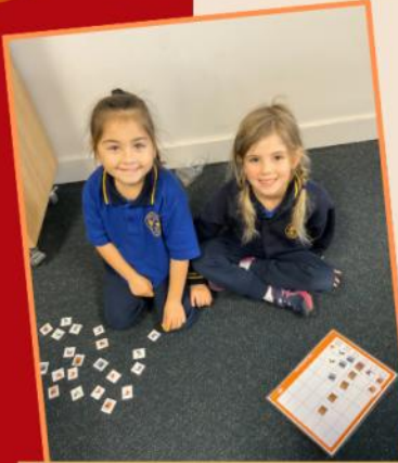
Foundation: learning animal names through games.