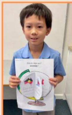
Year 3, 4: learning countries, nationalities and spoken languages: Making 3D globes to show countries in Chinese.