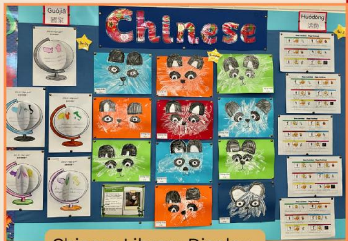
Chinese Library Display