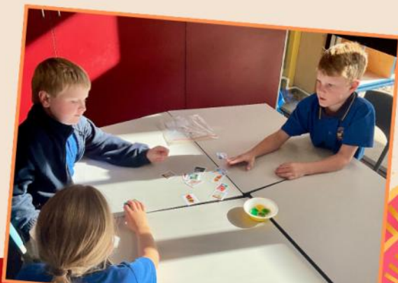
Year 2: learning drinks and putting them into 'I like to drink' and 'I don't like to drink' Chinese sentences.