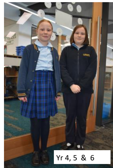
Yr 4, 5 & 6