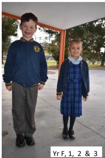
Yr F, 1, 2 & 3