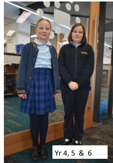
Yr 4, 5 & 6