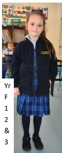
Yr F 1 2 & 3

It is not appropriate for children to come to school with dyed or inappropriate hair styles as deemed by the Principal.