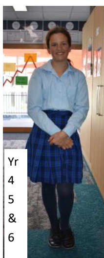
Yr 4 5 & 6