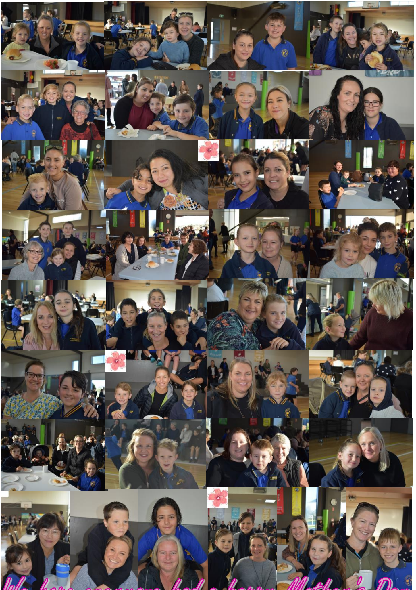
We hope everyone had a happy Mother's Day