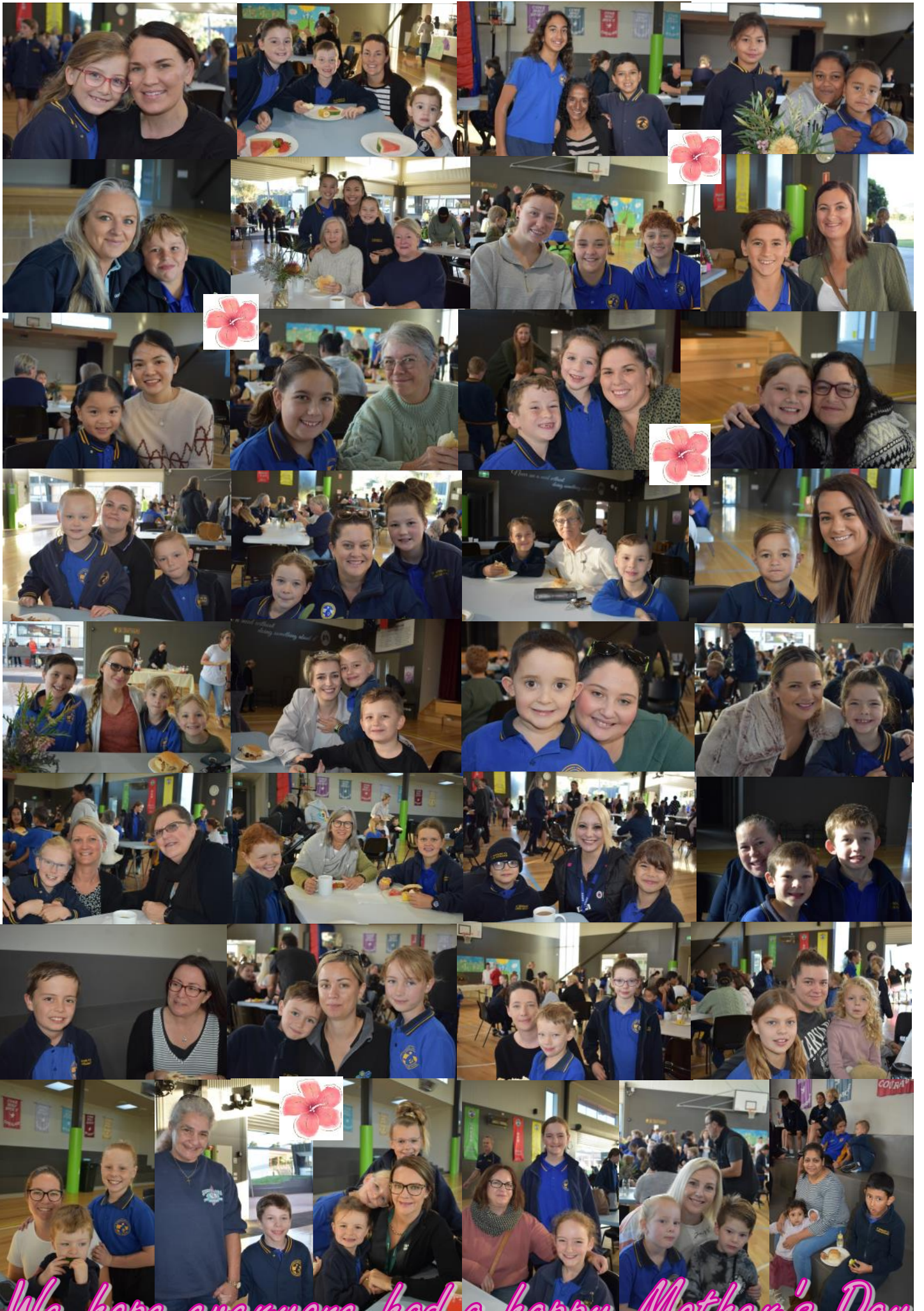
We hope everyone had a happy Mother's Day