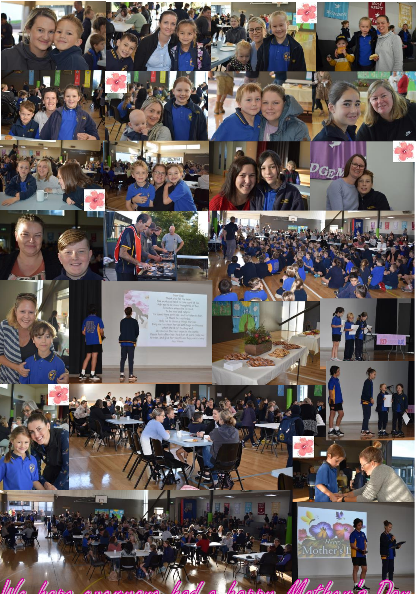
We hope everyone had a happy Mother's Day