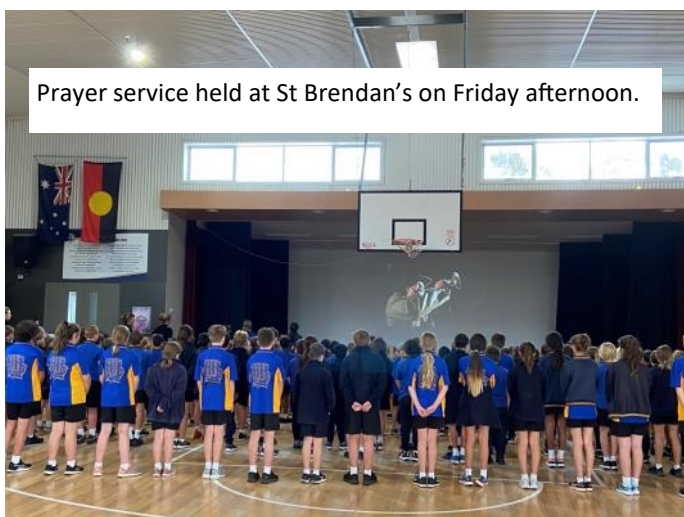
Prayer service held at St Brendan's on Friday afternoon.