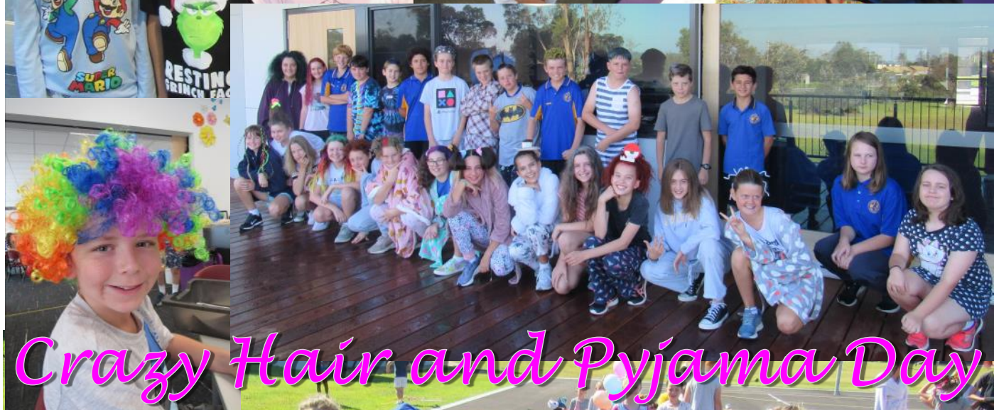
Crazy Hair and Pyjama Day