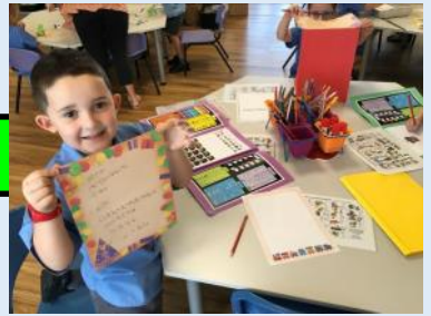
I loved writing. I got to write 'Maccas'.