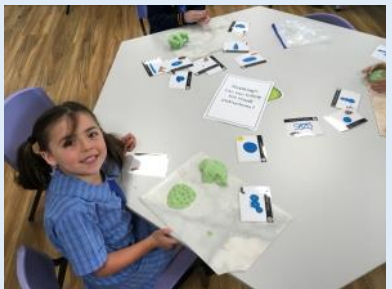
I made a cookie with playdough because I was following instructions. Kirby