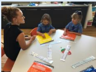
I wrote numbers to 24 in paint. Zari I was writing numbers . I learnt to write '7'. Lenni