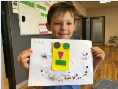
I was making a birdie. I wanted to make a picture for my mum. Lucas