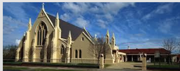
St Mary's Cathedral, Sale