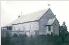
Gippsland's first Church in Tarraville, 1860s

The Sale Diocese was first begun in 1887.