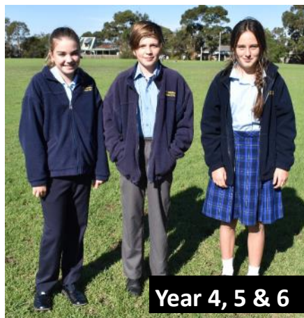
Year 4, 5 & 6

JEWELLERY is restricted to the following - a wrist watch, no more than one matching pair of studs or sleepers, a religious medallion on a chain to be worn under clothing. Fashion jewellery, make-up and nail polish are