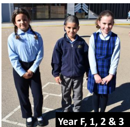
Year F, 1, 2 & 3

Please remember to name your child's uniform. We have lots and lots of jumpers in the Lost Property without names.